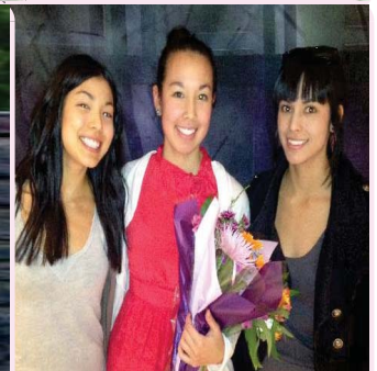
With Family Members